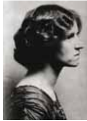
Malting House School and Susan Isaacs

1924, Susan Isaacs (1885-1952) started teaching at the new Malting House School, Cambridgeshire. Influenced by Dewey and Piaget's theories, she facilitated real-life learning journeys with much outdoor play, concerned with 'the meaning of the child's experiences to himself'. Isaacs was supremely qualified in observation as an experienced psychoanalyst and remarkable polymath. FS practitioners don't need to train to her standards yet her work highlights the importance of close observation and documentation. There is a need for practitioners to know how to observe and increase their sensitivity of response, reflecting on practice to identify where skills can be improved and scaffold when needed.