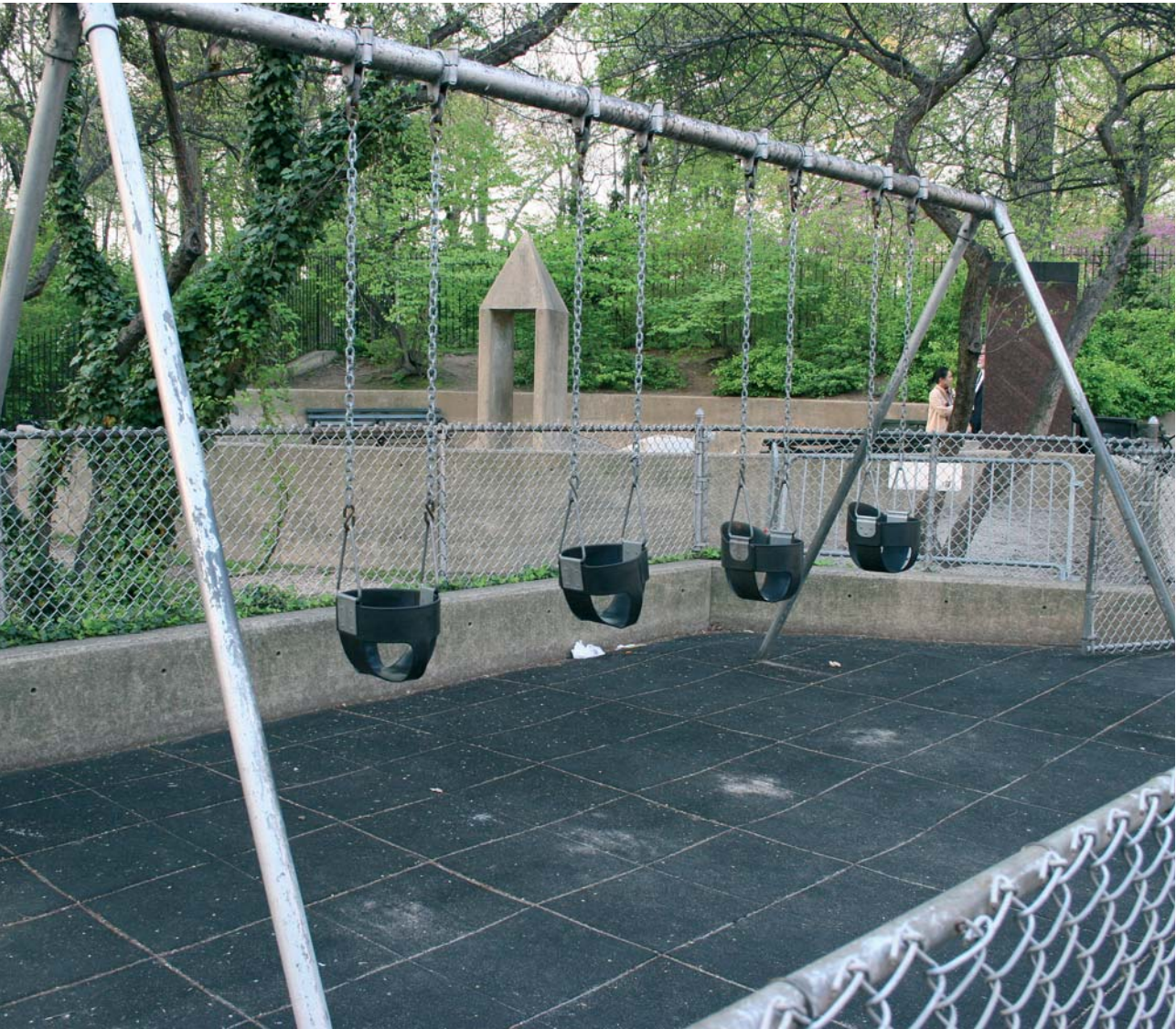
Swingset in a playground in Central Park, New York City. The all-embracing seats, safety surfacing and fencing are symptomatic of adult anxiety about children's safety.