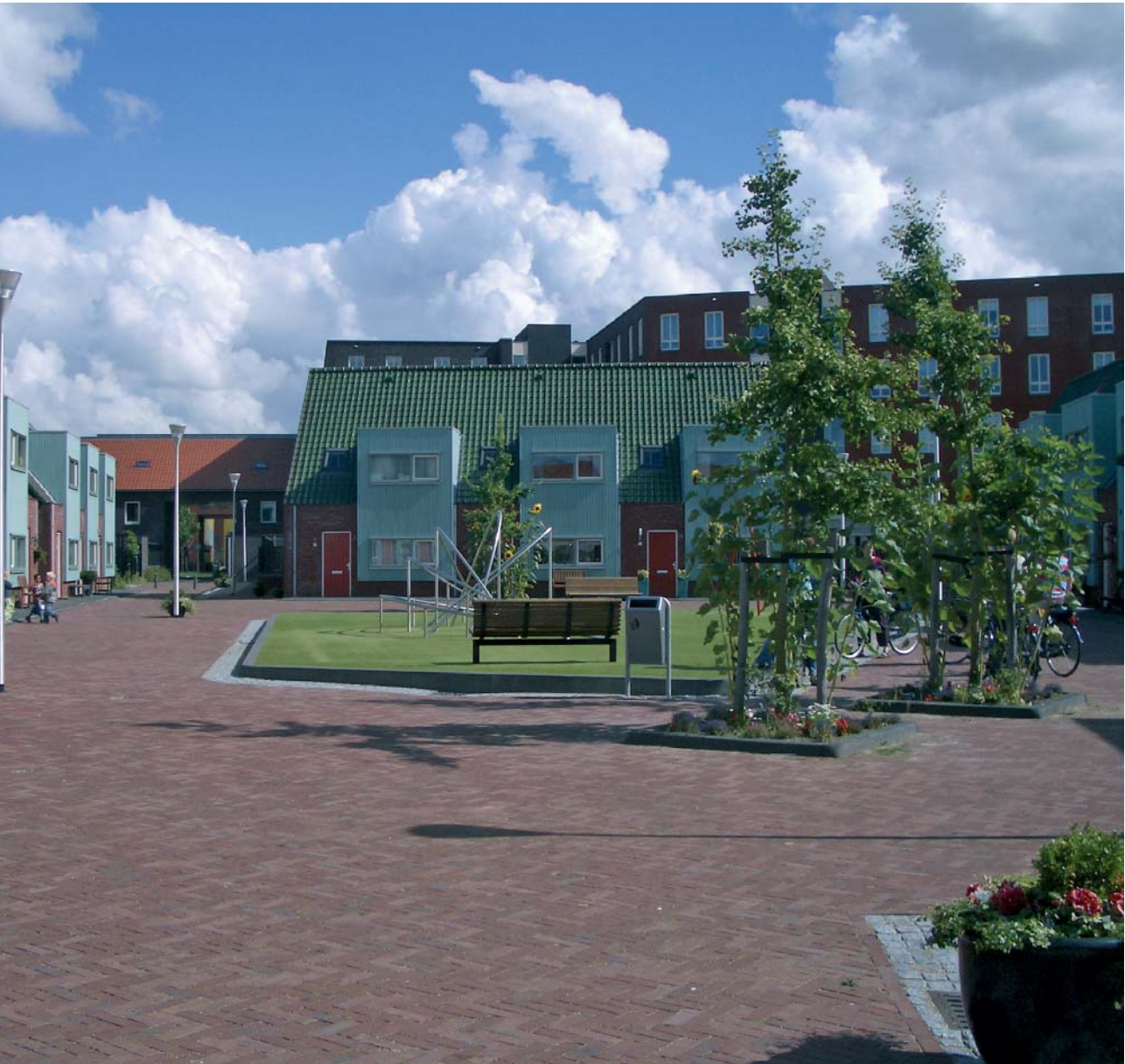
This area of new housing in Rijswijk in the Netherlands includes generous and easily accessible public space and play areas close to people's homes so that even young children can play outside safely.