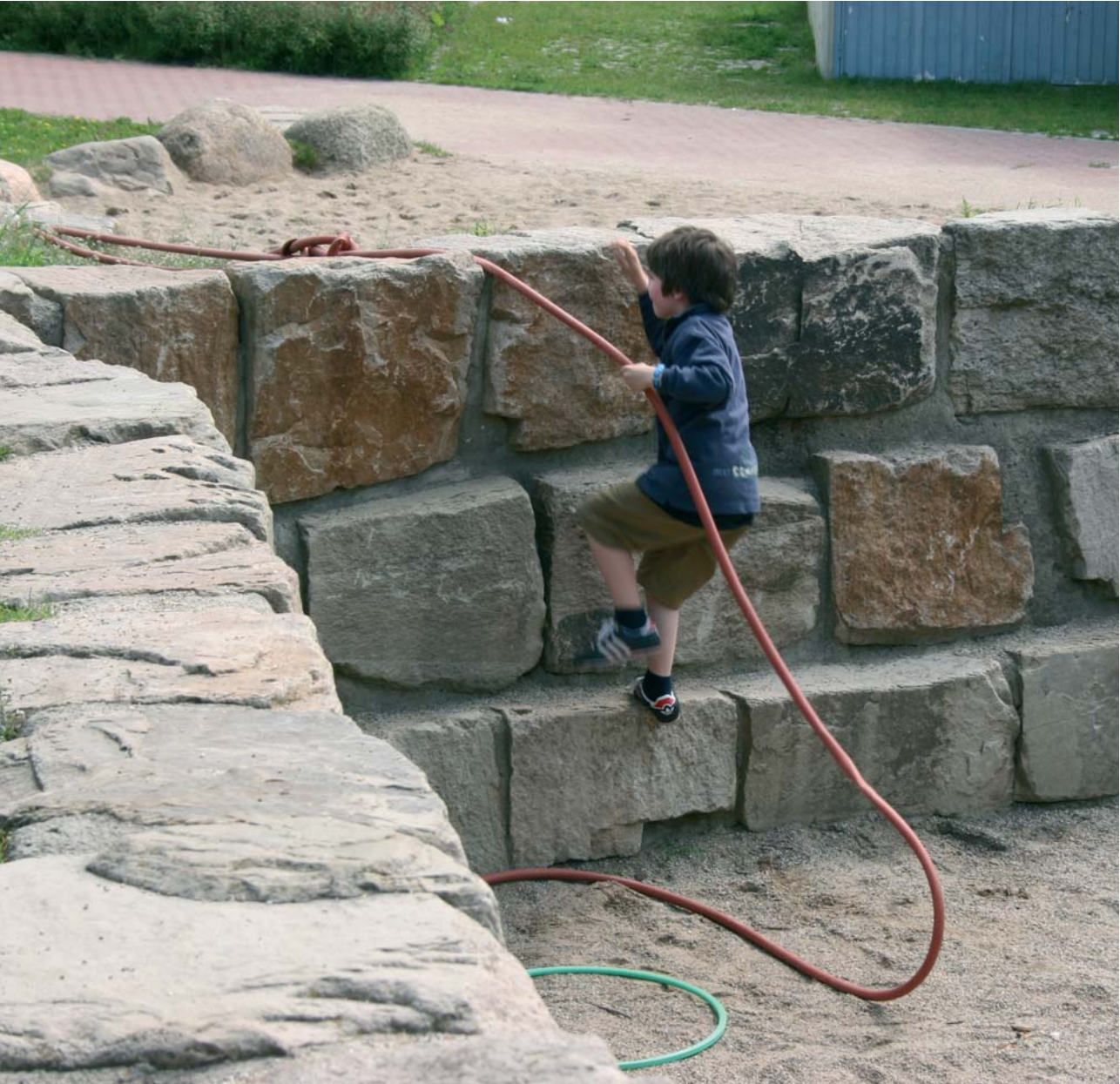
A school playground in Berlin which gives children the chance to challenge their abilities.