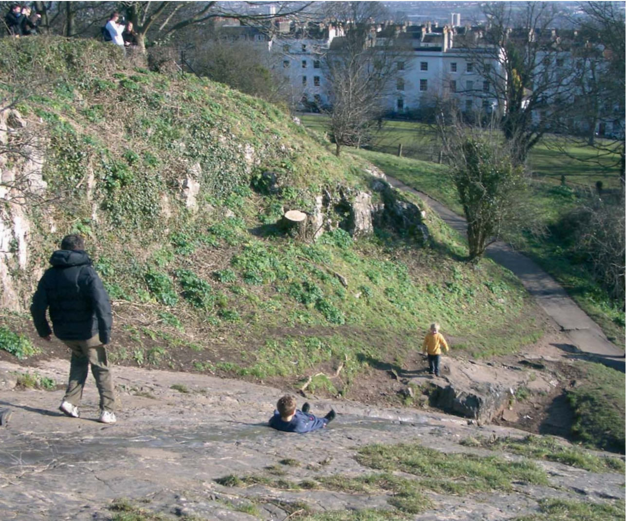
This natural rock slide at Clifton Downs in Bristol has been used for so long that the stone surface has been polished mirror-smooth. Even today it draws people of all ages who seek out the chance to test their abilities and their nerve, in spite of the obvious risks.