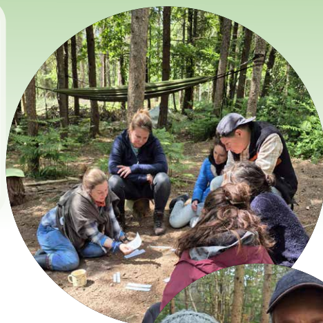
Participants on our Nature-Based Training for Psychiatrists and GPs

Four or more places: £320 each Individual place: £360 Price includes refreshments All participants receive a Certificate of Attendance